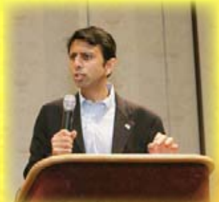
Congressman Bobby Jindal